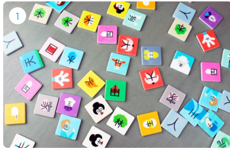
Lay all tiles on a flat surface.