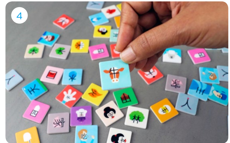
Player who finds it first wins.