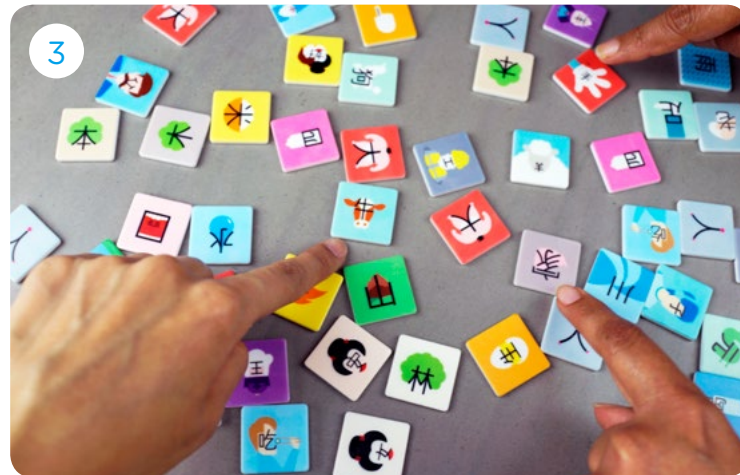
Every player searches for the matching tile.